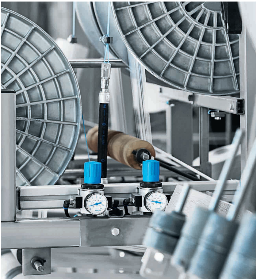
Pneumatic spring for tensioning warp beams in looms. Innovative solution consisting of fluidic muscle and pressure regulator.

How can a company in a high-wage country like Switzerland still manufacture textiles profitably? Wernli AG, also known under the label Wero Swiss, shows how it is done – with clever solutions for bandages and dressing materials. An equally clever solution from Festo helps out: the fluidic muscle DMSP.